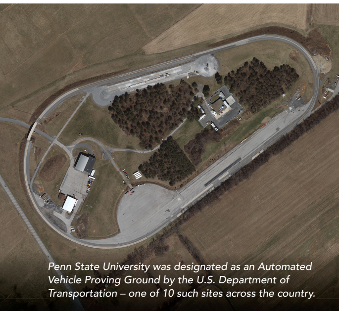
Penn State University was designated as an Automated Vehicle Proving Ground by the U.S. Department of Transportation — one of 10 such sites across the country.

"In short, we want to be a leader in this, a testbed," he said. "There's Silicon Valley, there's the Research Triangle, and we want to be known as the logistics mobility hub, creating options for the world to benefit from. This project is attracting companies here, too. Some 70 automobile-sector companies are based in this region. They're interested in the logistics and innovation research being done, this disruptive technology, this playground we're creating." 🦁